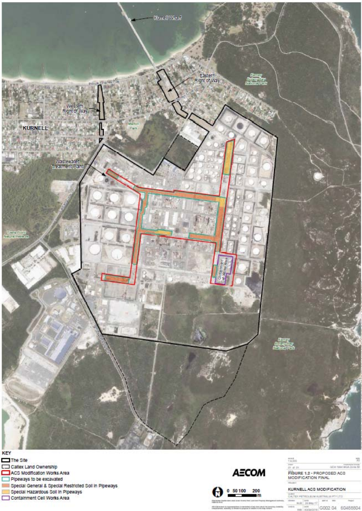
Figure 4: ACS Management Works